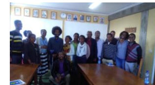
Figure 2: Students on soft skill Training Figure 3: SCDC Members on TOT