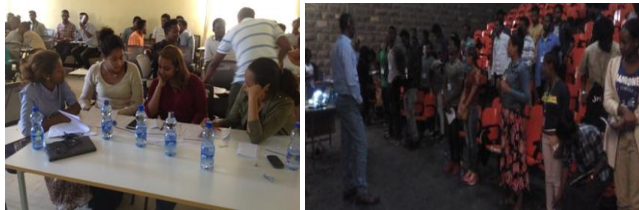
Figure 4: Students on soft skill Training