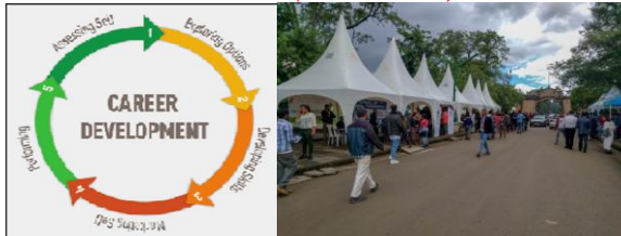
Job fair 2019 @ aau 6k